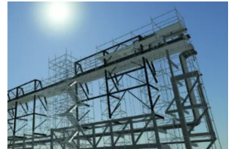
Scaffold Work Packages